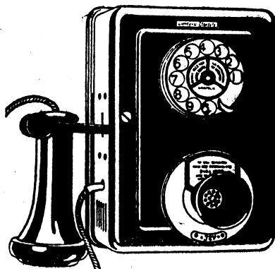
WALL TELEPHONE WITH DIAL

Save This Announcement. You will find it helpful in using the new system. We are publishing this advertisement, and asking your co-operation in order to make Norfolk's new telephone service a success from the start.