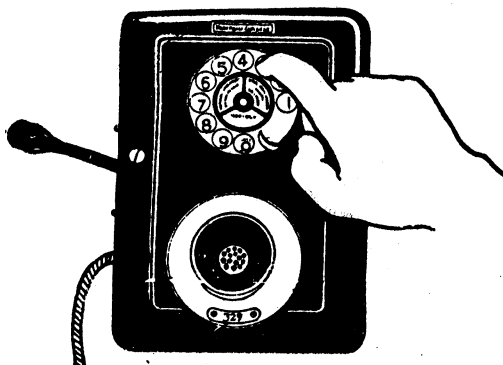
READY TO DIAL "1," THE FIRST FIGURE OF THE NUMBER GIVEN AS AN EXAMPLE

THE satisfaction derived from the new system at the outset depends largely on the readiness with which our subscribers and the public generally operate the dials. To make it certain that every one understands how to use the Automatic System, we make the following explanation. Every telephone user should study it carefully.