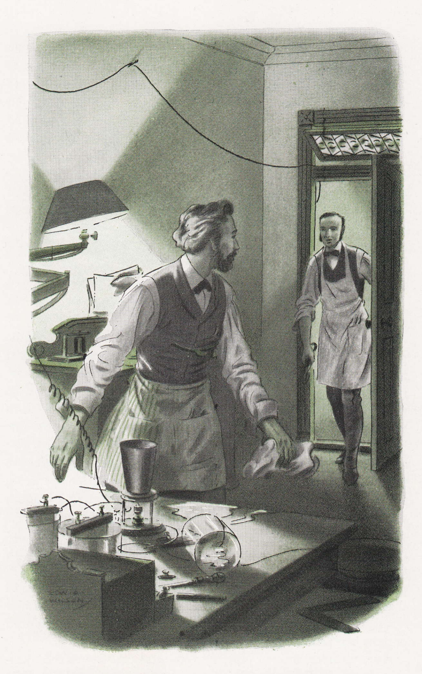
"Mr. Bell, I heard every word you said-distinctly!"