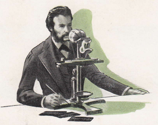
The human ear phonautograph traced speech patterns.

Bell wanted to use these devices to show his deaf pupils what