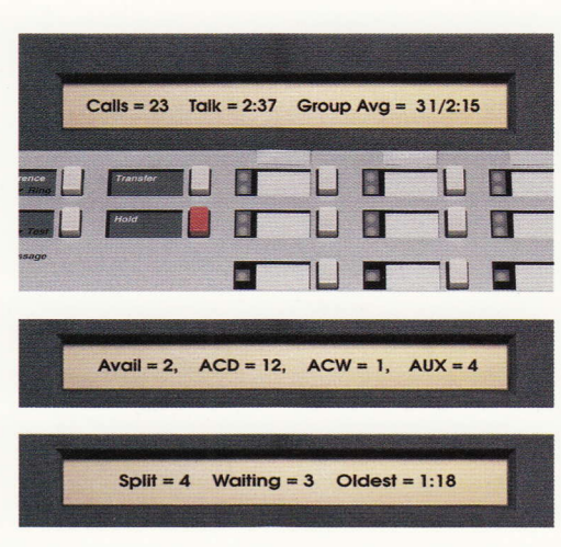
VuStats allows agents to monitor call center data of particular interest to them and be alerted when personal thresholds are met or exceeded.

After every call, agents can enter Call Work Codes to help you measure productivity and performance.