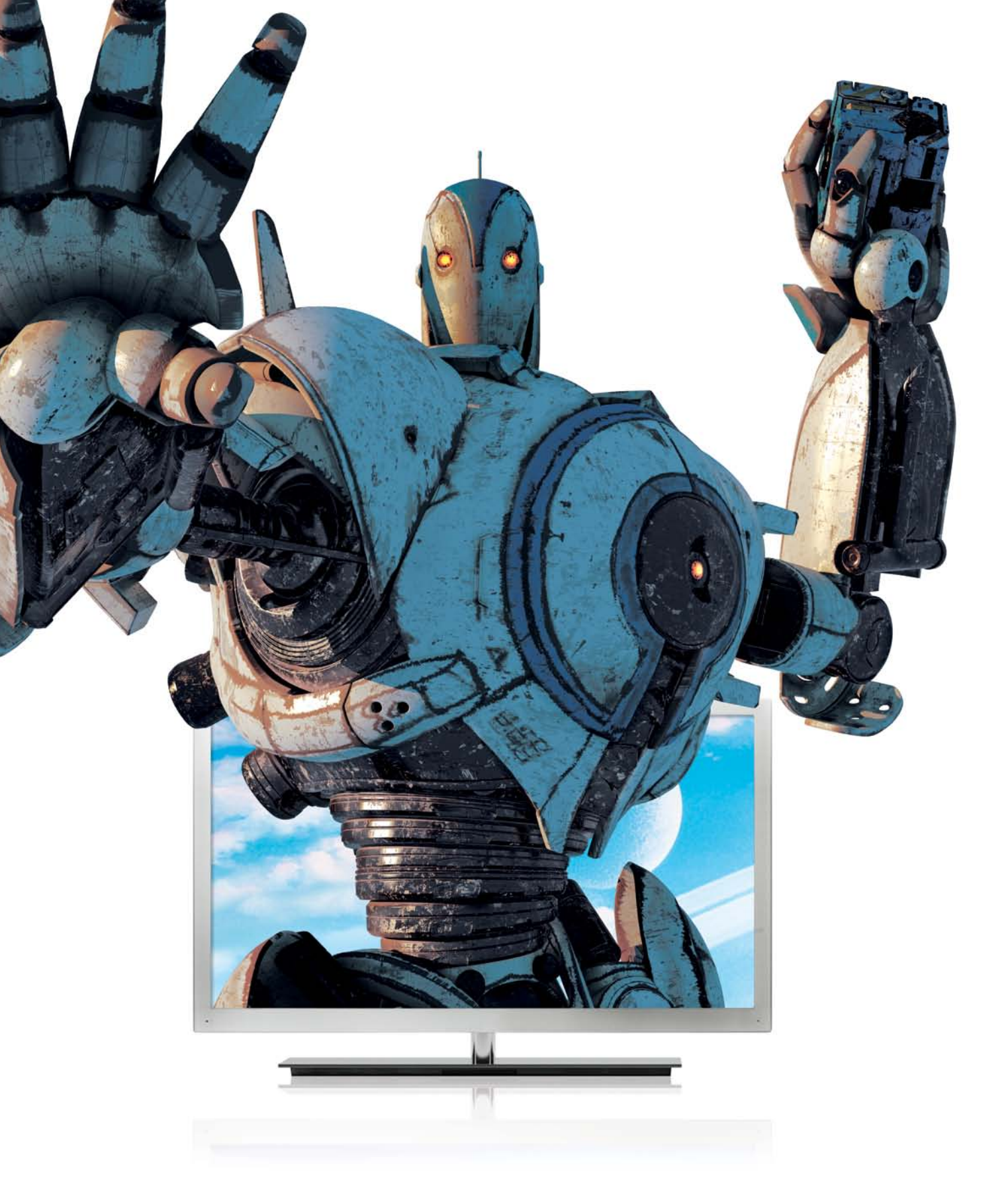
Amazing Fibe TV