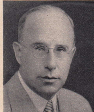
CHESTER I. BARNARD President of the New Jersey Bell Telephone Company. Started with the Bell System as a clerk in Boston in 1909.