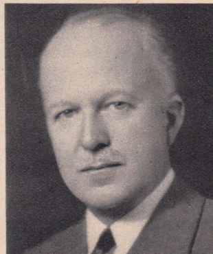
WALTER S. GIFFORD President of the American Telephone and Telegraph Company. Started as a clerk with the Western Electric Company in 1904.